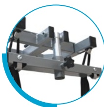
Swivel sling (for sideways gait)