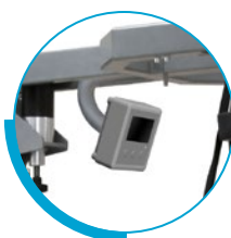
Electronic measurement unit

Eleveo is a training device for simultaneous control of unloading, posture and balance on a treadmill or firm surfaces. Systems providing dynamic unloading are a perfect solution for training patients in a wide range of gait disorders. Eleveo helps to maintain proper posture, reduces load, eliminates balance problems and improves motor coordination training. Unique harnesses are designed for uni- or bilateral support of the body as well as for a gradual level change from fully loaded to fully unloaded. The device allows for a manual controlled treatment of lower limbs and pelvis to ensure proper movement. Configurability of the device allows the clinics to treat various patients with a single Eleveo system. Extra options help to adjust the system to specific needs of each patient.