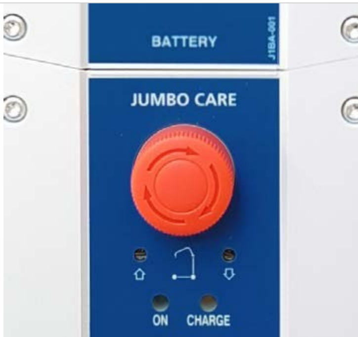
Emergency stop button