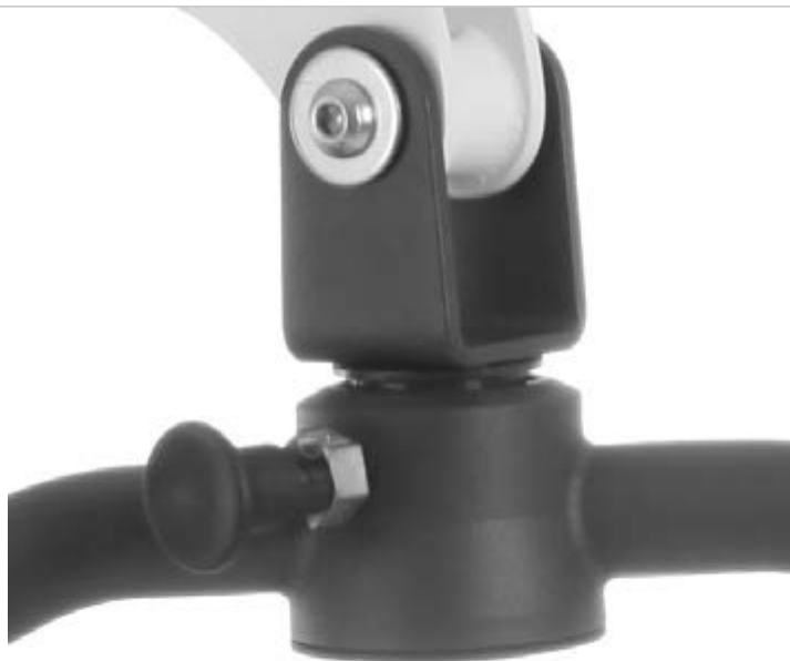
Hanger bar lock - in version Standard