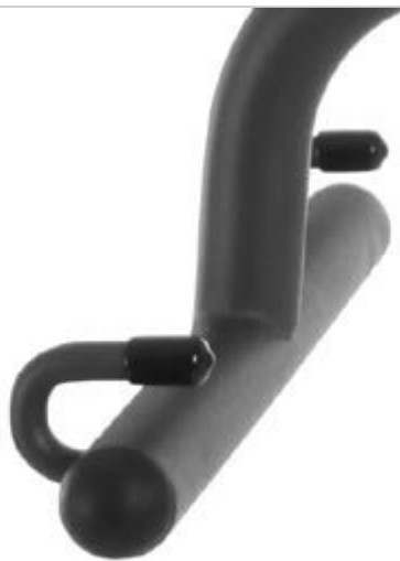
Sling 4-point attachment - 4 hooks for loop sling fastening