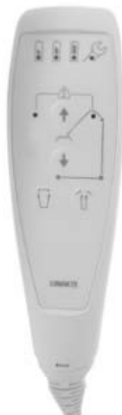
Remote control - ergonomic and easy to use