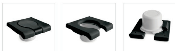
Easy removable bucket (option)