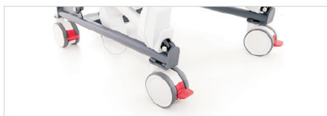
4 castors with brake (brakes prevent the device from moving during use when necessary), 3 battery-powered actuators (waterproofed, dustproofed for height adjustment)