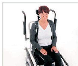
Armrests - can be lifted for easy access to the patient

Adjusted with a manual remote controller (ergonomic and easy to use) for optimal positioning of the patient.