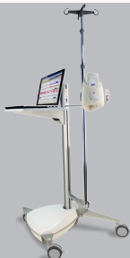
Goby CT Cart