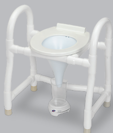
Goby EQ Flow & EMG option