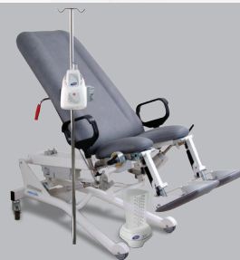
Goby SC Sonesta Chair