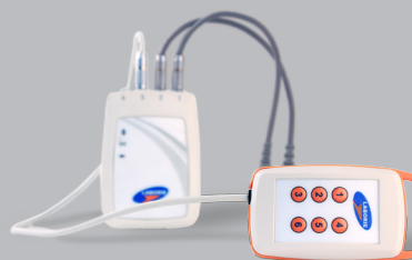
Ambulatory Mobile 24-hour recording option