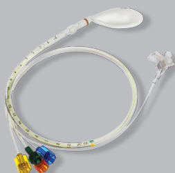
ARM 4-pressure Anorectal Manometry option