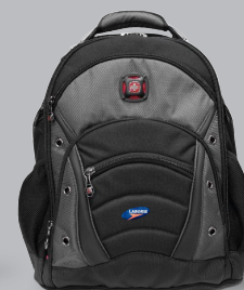
Portable Backpack option