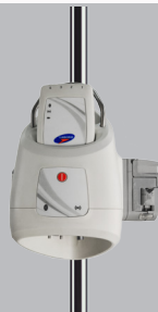
Goby IV IV pole